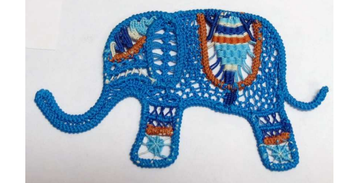
2nd Place - Diane Haber